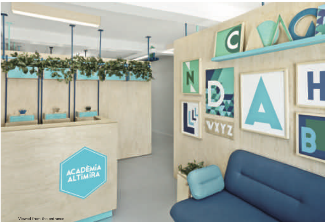
Viewed from the entrance